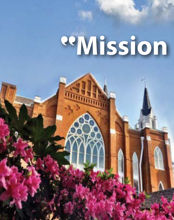
Marvin Methodist Church-Tyler, TX

The subject of our recent “Mission Accomplished” case study had taken a church discipleship assessment in 2021 at the beginning of the coaching process with Ascending Leaders. The church took the assessment again in 2024 and showed measurable improvement since 2021. Most notable were the following: