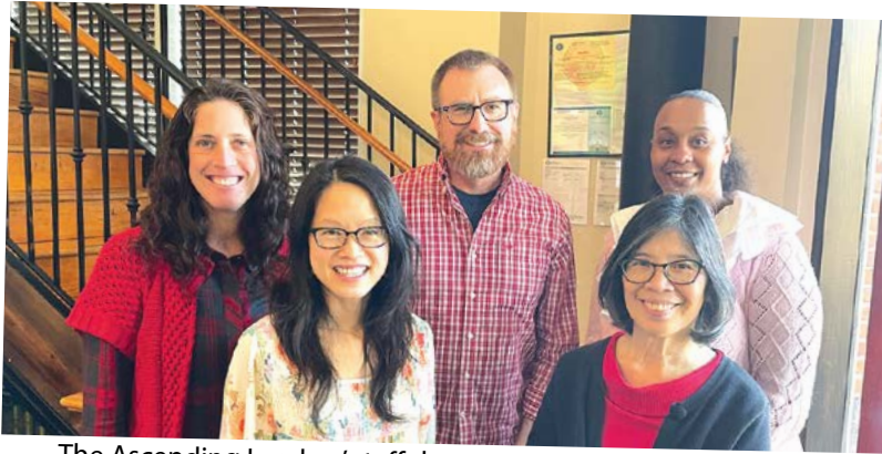
The Ascending Leaders' staff that supported Marvin Methodist.

"God opened the door for opportunities. One was the Disciple Training Session. I did NOT want to attend... but one of the pastors thought I did, so he put my name on the list. Actually, it was God who put my name on the list! That "training" was TOTALLY opposite of what I expected it to be and so VERY personal, and was focused on learning to be a disciple through the Lord's leadership, day by day training, personally, by Him walking with me. It was a final "breaking" away from MY plans to totally putting myself into HIS hands. My attitude is focused on my walk as a Disciple of Jesus and how another's life can be affected by my actions and outreach."