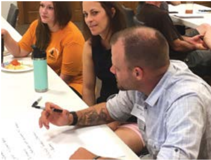
At the Greensburg quarterly gatherings, the discipleship teams of the churches learn, plan and share.