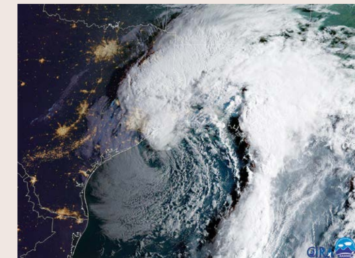
Satellite image of Harvey

Like everyone else in the region, Ascending Leaders' plans for the fall drastically shifted. Three staff members evacuated, family and friends endured flooding of their homes, and it was a month before the whole team was back together at our offices in Sugar Land. One church in a coaching partnership had over 200 members flooded.