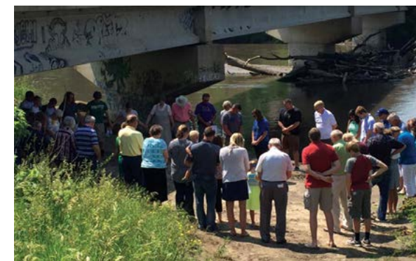
A gathering of Prairie City CRC at the river.