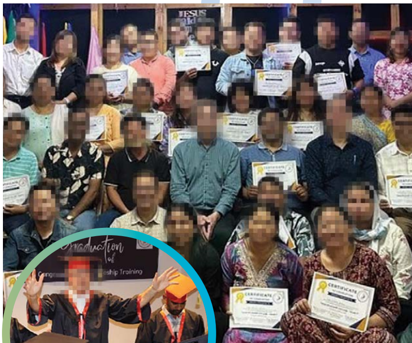
Graduating church leaders trained in discipleship.